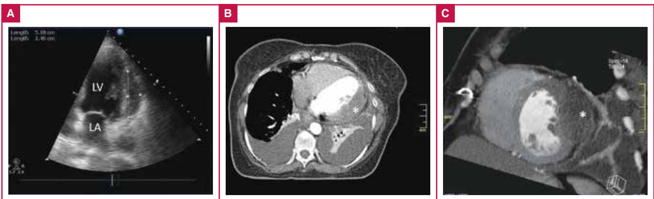
Fig. 2. A. Transthoracic echocardiography. B, C. Axial and sagittal computed tomography sections of the heart. Intra-myocardial haematoma is seen in both echocardiography and computed tomography (asterisk). LV, left ventricle; LA, left atrium.

Left ventricular apical location of the DIH has higher spontaneous reabsorption rates so conservative management is preferable for this position. Evacuation of the DIH and surgical