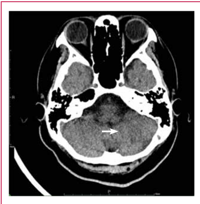
Fig. 3. The initial hypodense lesion progressed to chronic encephalomalacia of the left cerebellum (white arrow).

after a total of 18 days on Levitronix® haemodynamic support. One week later, a tracheostomy was performed, and the patient was weaned from the ventilator a week later. The follow-up CT showed chronic encephalomalacia of the left cerebellum (Fig. 3).